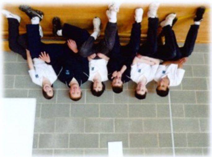
Sum's Up Our First Few Years.