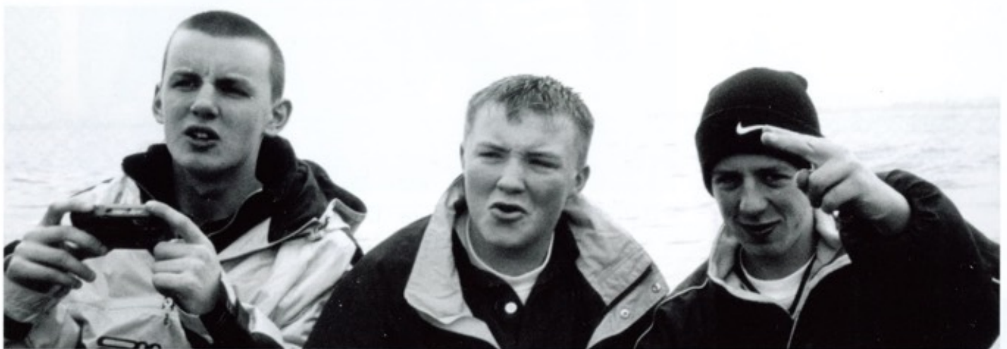
"Booakasha. Big up yaself!! Raspect!