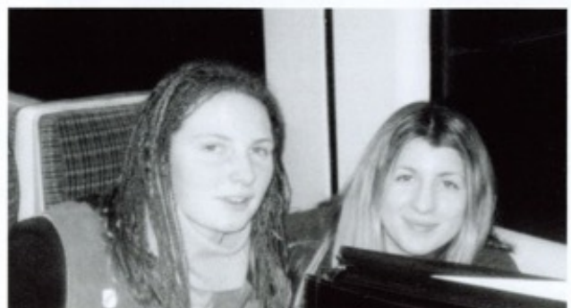
The Braidy Bunch