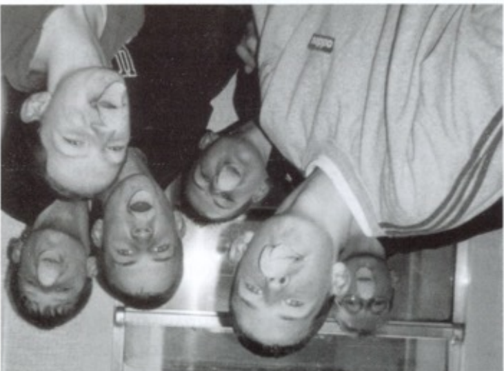
Birds of a feather stick together!!!