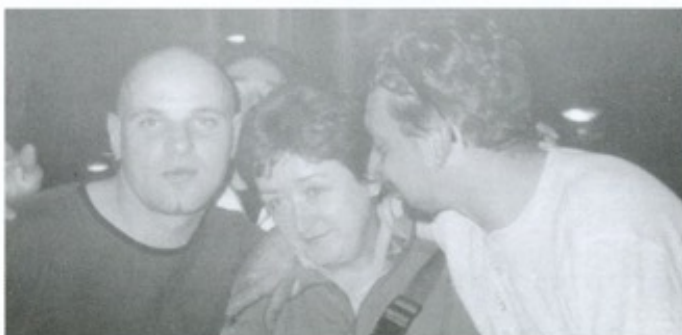
... but back home I'm a respected teacher!