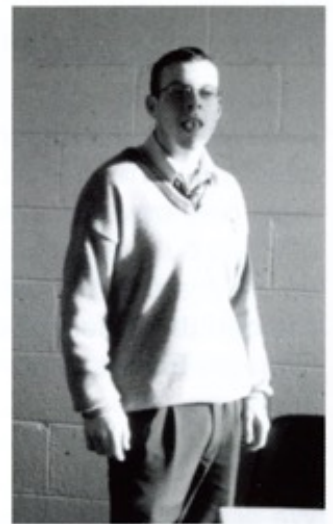
"I'm tooo sexy for this class!!!!!!"