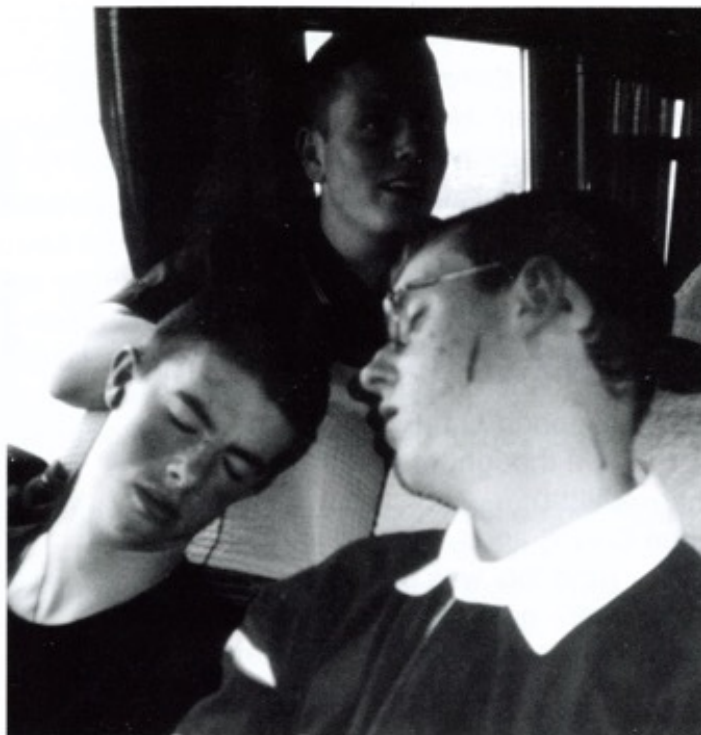
Just hold me!