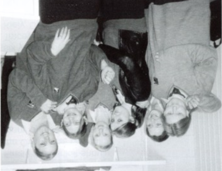
I think someone is pointing a camera at us!!