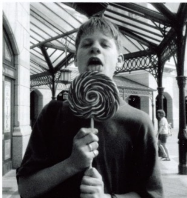
All together now "Me and My Lollipop"!!!

(We all want to be invited to the wedding!!!!)