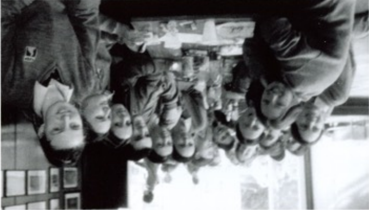
Who's for lunch, darling!!!