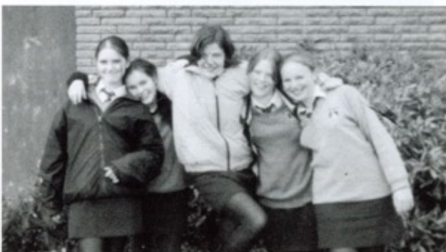
....and here are our legs