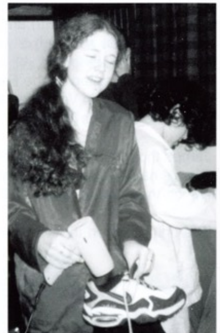
Just don't get me started!!