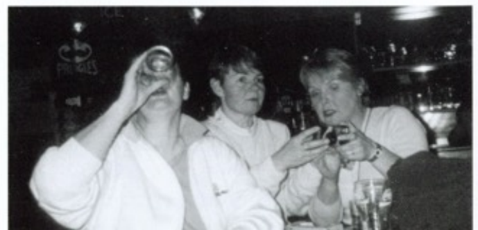
I just can't take the pressure!!