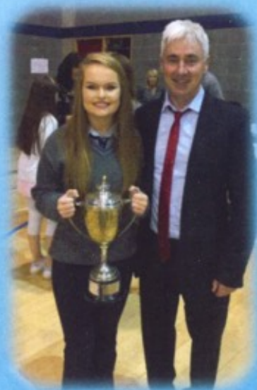
Student of the Year